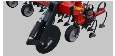
Spring loaded stabilizing disc.

The very small but powerful vibrations results in an improved cleaning effect causing minimum soil sideways throw.