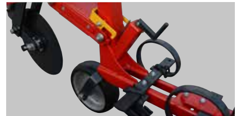
Depth control with spindle.