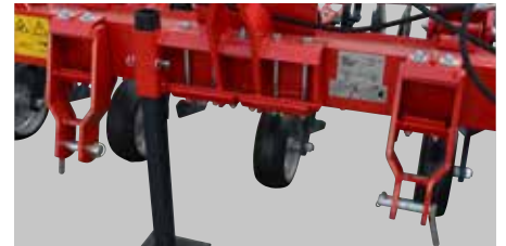
Independent moveable connection brackets.

To alter the spacing between the individual units is very straight forward. Adjustments in row spacing is done by one single bolt on each unit.