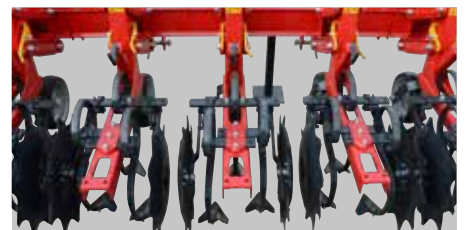
3-tined row section for row spacings from 45 – 55 cm.