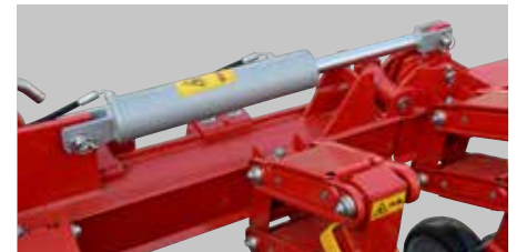
Patented system for locking/unlocking.