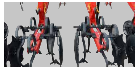
5-tined row section for row spacings from 55 - 80 cm.